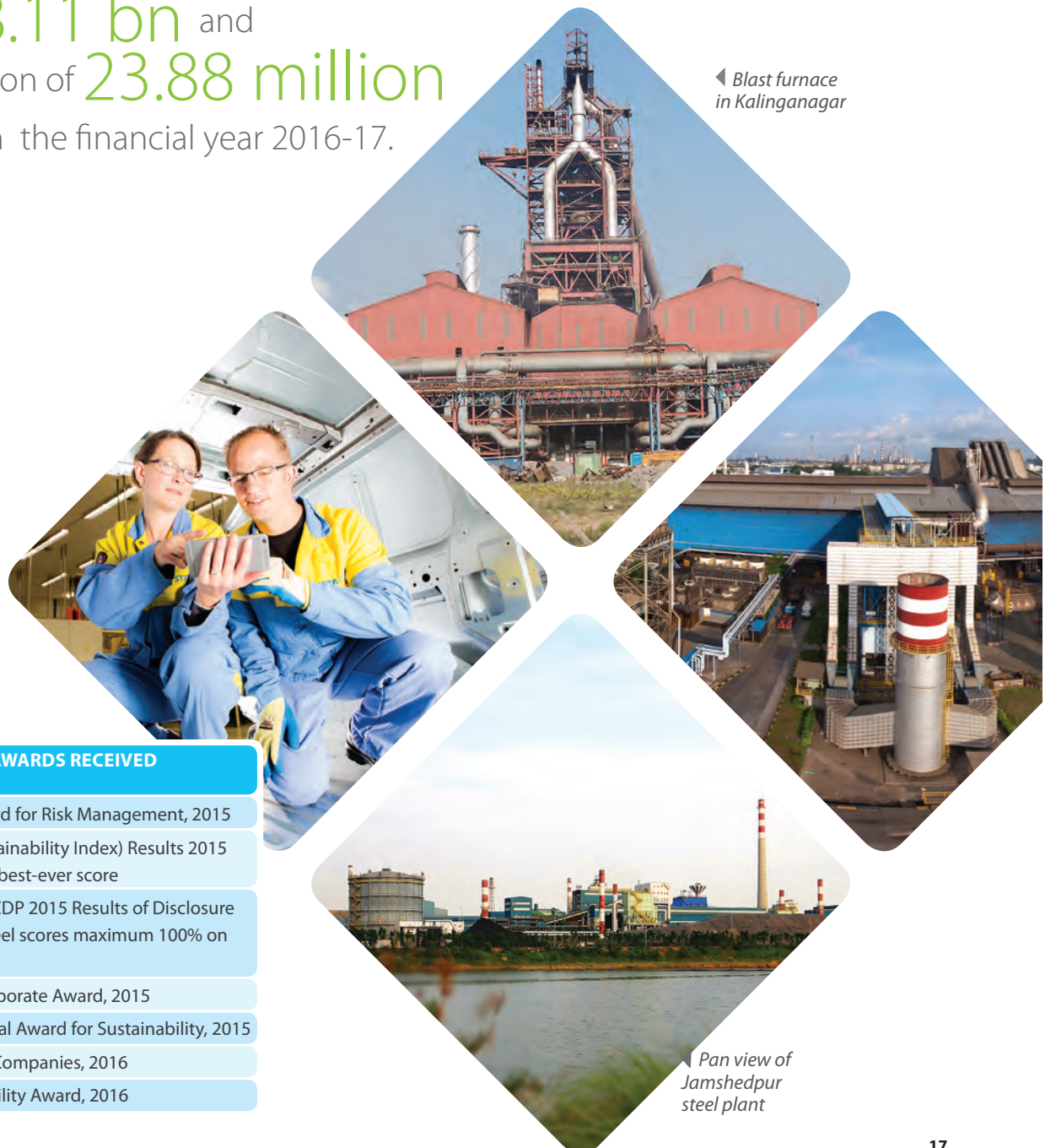
◀ Blast furnace in Kalinganagar

It is also the world's second-most geographically-diversified steel producer . The Group recorded annual turnover of US$ 18.11 bn and annual production of 23.88 million tonnes in the financial year 2016-17.