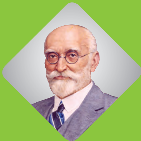
Sir Dorabji Tata Chairman (1904–1932)

The founder of the Tata Group, was a visionary, nationalist, philanthropist and humanist. He pioneered India's industrialisation at the turn of the 20th century, injecting a lasting passion and spirit of enterprise that was to last for centuries. He also introduced industrial welfare practices, well before their time.