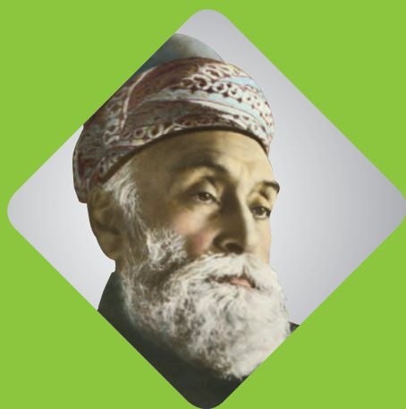
Jamsetji N Tata Chairman (1868–1904)

Over the decades of its existence, the Tata Group has had at its helm visionaries and business giants, each of whom have played a defining role in shaping the Group to become the global organisation that it is today.